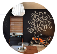
LETTERING & 3D PRINTING