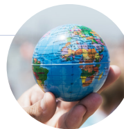
TRAVEL & DISCOVER

Growing with a company that includes an enthusiastic team, while involved in exciting new projects and sharing a proactive attitude.