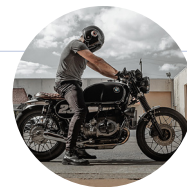
BUILT MYSELF CAFE RACERS